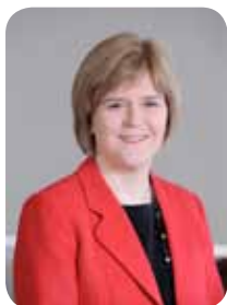
Nicola Sturgeon, MSP Deputy First Minister and Cabinet Secretary for Health and Wellbeing Co-Chair, Life Sciences Advisory Board

In 2005 the Life Sciences sector outlined its 2020 Vision for Achieving Critical Mass. This Vision still remains in our sights. However, we face a very different world today. The deepest global recession in a generation resulted in a period of declining output for the Scottish economy, but growth returned in 2010, and the latest forecasts show that this is likely to accelerate in 2011. It is within this context that the Life Sciences Advisory Board (LiSAB), working closely with the Life Sciences sector across Scotland, has reviewed the Life Sciences Strategy.